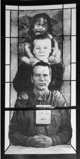
8. Menfolk Study 1 (work in progress) by Debora Coombs http://www.massmoca.org/kidspace