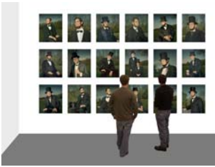
4. Nineteen Lincolns by Greta Pratt