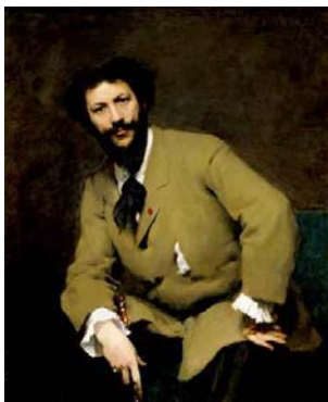
1. Portrait of Carolus-Duran by John Singer Sargent