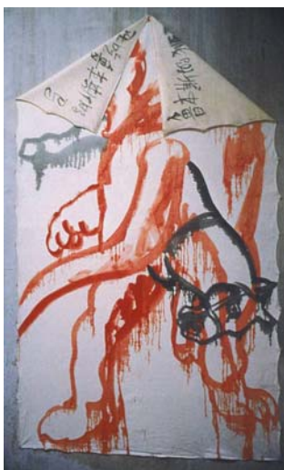
2. Rubens' Lion Bites Rubens' Horse by Huang Yong Ping http://www.massmoca.org