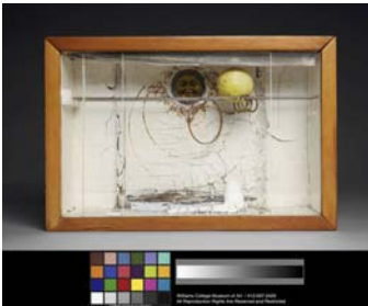
5. Sun Box (front) by Joseph Cornell