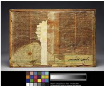
6. Sun Box (back) by Joseph Cornell